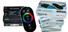
LT-09S-RF 6 Key RGB "touch" controller 12/24V DC