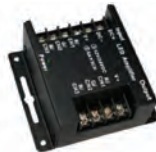
LT-390A Signal amplifier for RGB

NOTE: See page 34-35 for the complete range of aluminum extrusions.