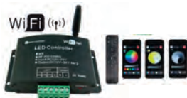
LN-CON-WIFI-3CH-XV WiFi controller for RGB, c/w RF remote 12/24VDC