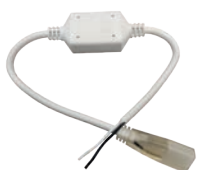
YH-2835D-PWP 15A Hardwire Power Cord