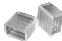
YH-ENDCAP End Cap