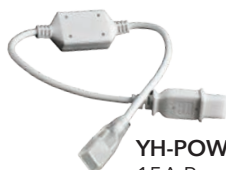
YH-POWERPLUG-15A 15A Power Plug