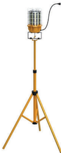
LWL-TM Tripod Mount